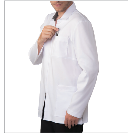
MANCHES LONGUES LONG SLEEVES